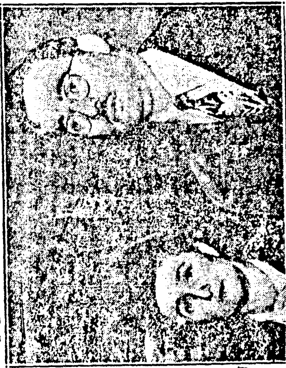
Mr. and Mrs. Julius Rosenberg—lose appeal.